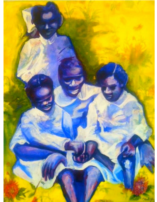
Top: Garden Flowers, New Freedom Series, informed by images from the Penn Center Archives.